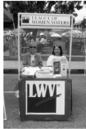
THE LWVBC'S NEW information booth at the Manhattan Beach Old Hometown Fair!! It provided us good visibility, and provided fairgoers important election info.