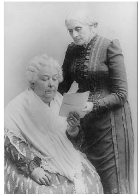
Elizabeth Cady Stanton and Susan B. Anthony